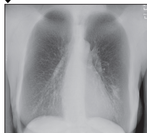
Original CRBS Image