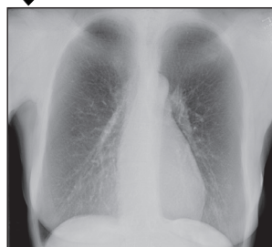
Warped, Prior CRBS Image