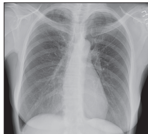
Original Prior Chest X-ray